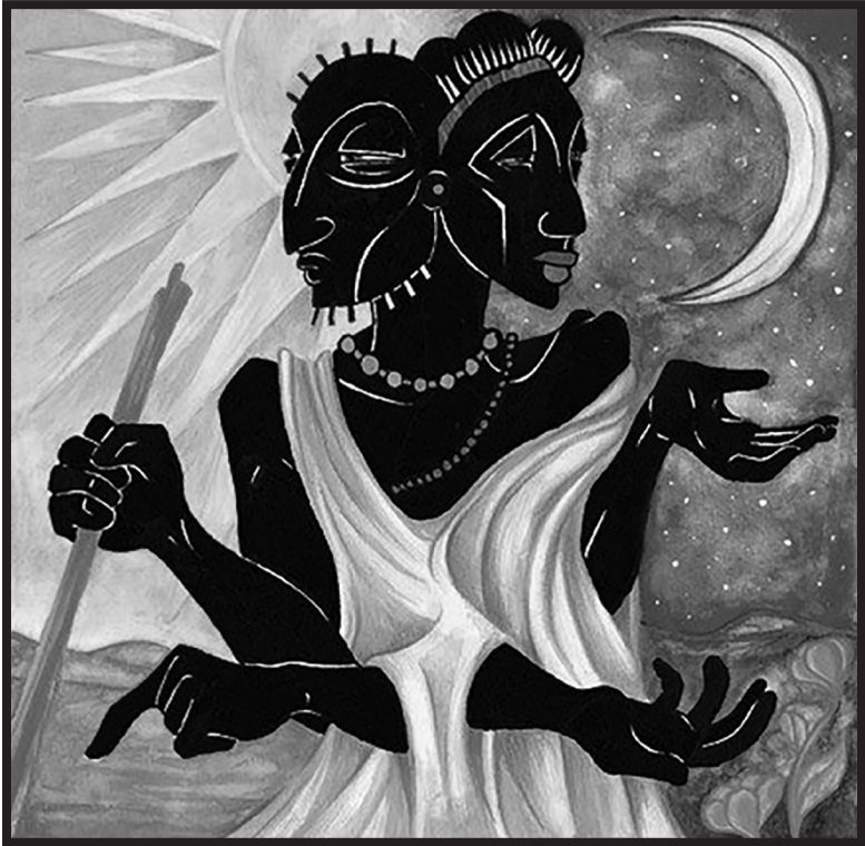
African Third Gender Art